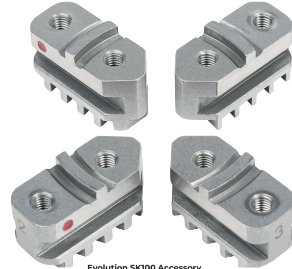
Evolution SK100 Accessory Mounting Jaws - Code 106818

Look through the back of the chuck to see the screw. To remove the mounting jaws, first remove the safety screw A .